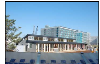
Donguri Nursery (Kashiwa)