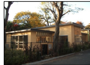
Mukunoki Nursery (Komaba)