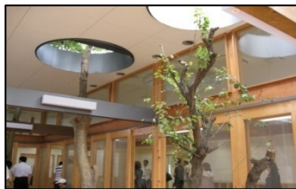
Himawari Nursery (Shirokane)