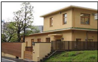
Keyaki Nursery (Hongo)